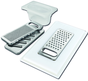
Graters kit with ring-holder and food collection tray 8159 101