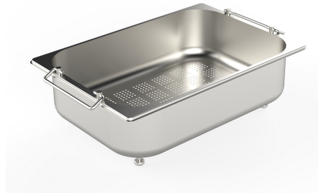
Stainless steel colander 8154 000