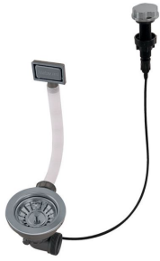
Gun Metal automatic waste fitting 8407 110