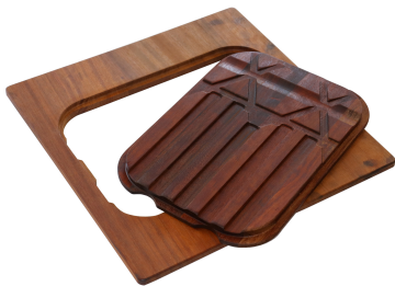
Iroko-wood twin chopping board 8644 004