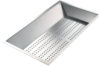
Stainless steel perforated tray 8151 000