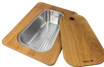
Iroko-wood chopping board with stainless steel colander 8644 042