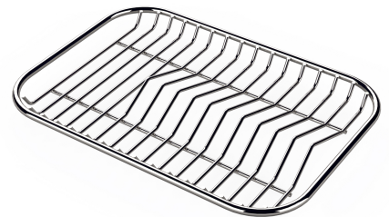
Stainless steel plate rack 8100 154