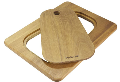
Iroko-wood sliding chopping board 8644 041